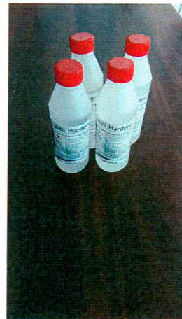
Fig. 2: Hardener, ref. No. 415600877/7